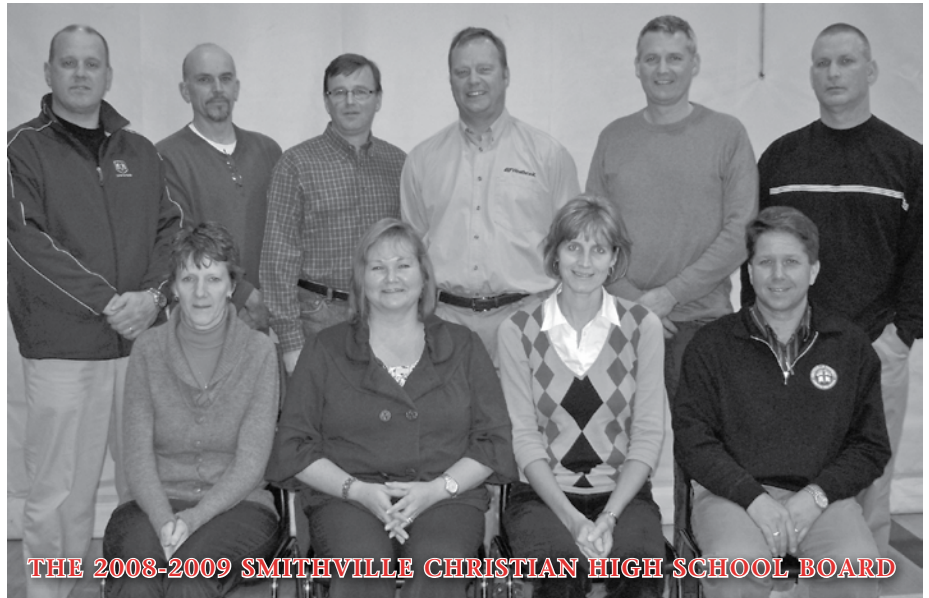
THE 2008-2009 SMITHVILLE CHRISTIAN HIGH SCHOOL BOARD