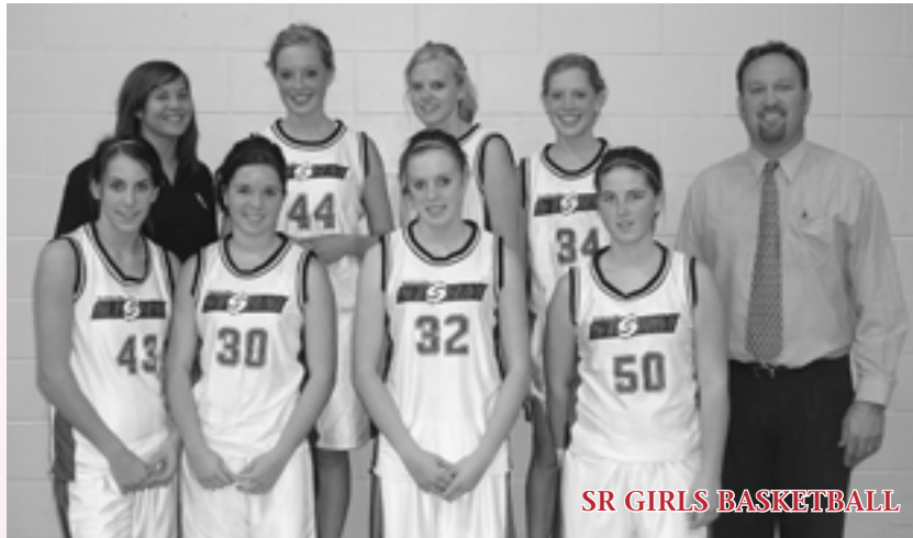
SR GIRLS BASKETBALL

The new season has already begun. Check out the home game schedule for Boys Basketball and Girls Volleyball teams and come on out to cheer on the storm to more great victories! ◀