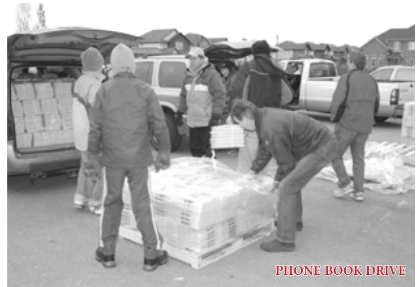
PHONE BOOK DRIVE

Please remember your Board in your prayers as they continue in God's good work in this school.