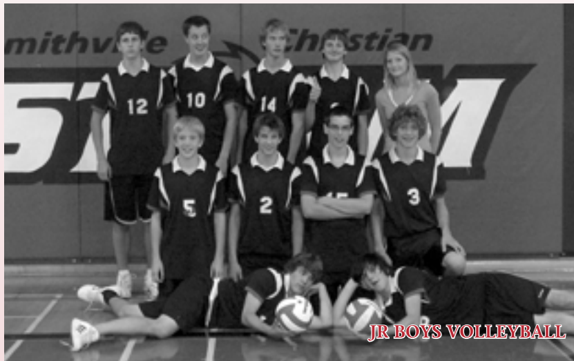
JR BOYS VOLLEYBALL