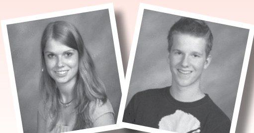
2005 - Grade Eleven