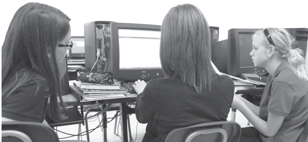
Students entering survey results into a database.