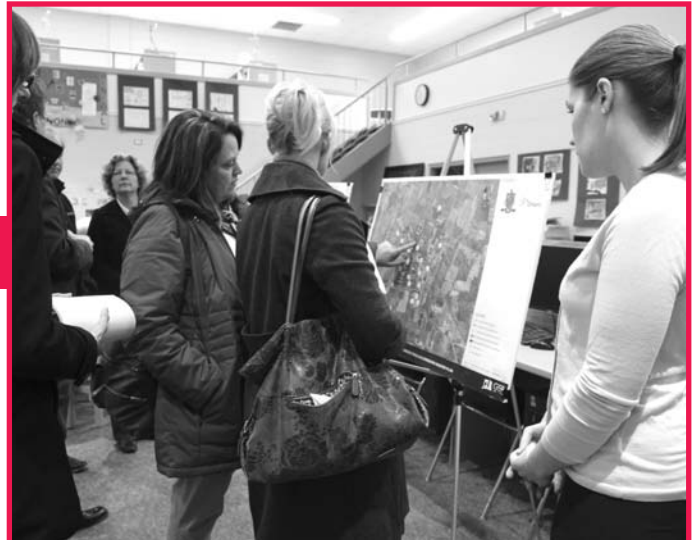
Members of the public at a Trails & Corridors open house held at Smithville Christian High School